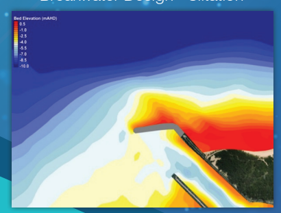
Breakwater Design - Siltation