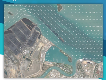
High Resolution Current Prediction